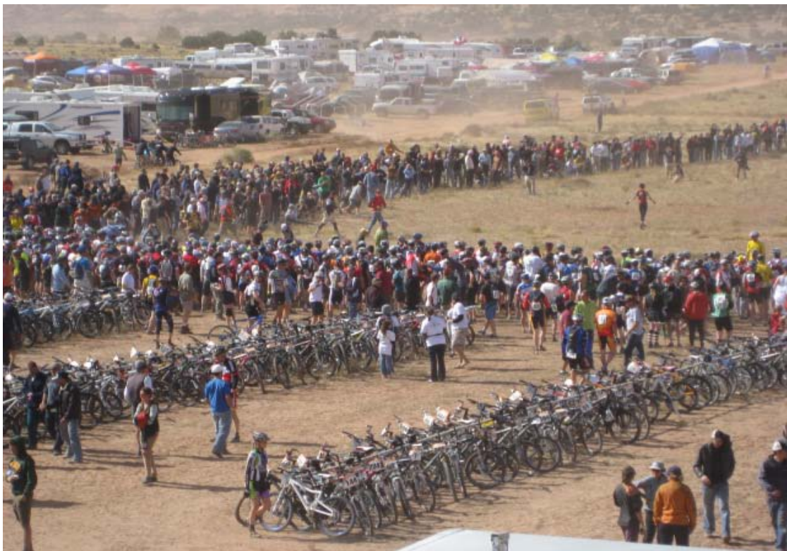
360 teams getting ready for the Lemans start at high noon