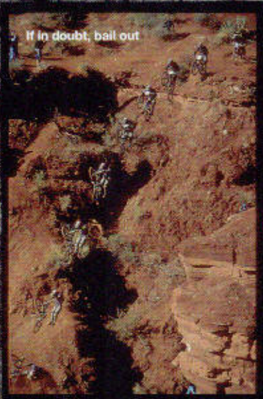
If in doubt, bail out