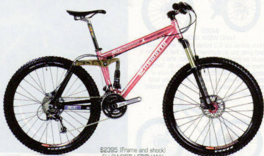
$2395 (Frame and shock) ELLSWORTH EPIPHANY

Intense took the time to get the 6-Point-6 right, and it was definitely worth the wait. The 6-Point-6 will not be winning any cross-country races, and you won't see this bike launching off of red-rock cliffs in front of the hungry press. You will, however, be seeing a number of these versatile speedsters whenever the trails are technical and the fun meter is pegged. If you are a try-anything, go-anywhere trail rider, and have the money to burn, you will not be disappointed with the intense 6-Point-6.