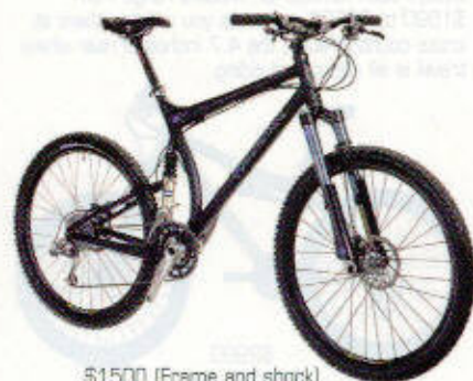
$1500 (Frame and shock) MAVERICK ML7

After a year of redesign, the Ellsworth Enlightenment is an entirely new creature; it now features a 7000 series Scandium front triangle and an Easton carbon dual monostay rear end. Ellsworth calls it a Firmtail because it does not ride like a hardtail. Interchangeable dropouts allow each frame to be converted from single-speed to a geared bike. It will ship with the dropouts for gears, and SS dropouts can be purchased separately. Available in both a 29'er and 26-inch version.