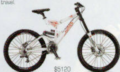
$5120 SCOTT HIGH OCTANE

Knolly says their V-Tach is "nimble enough to get you into trouble; solid enough to get you out." This escape vehicle has 7.7 inches of rear wheel travel and linkages that look like you could flat-tend them for years without complaint. The full-length seat tube is a very nice touch for a bike with this much travel.