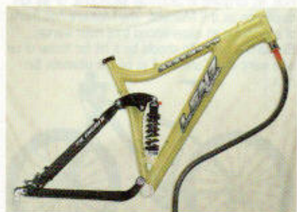
$1875 (Frame and shock) LENZ BEHEMOTH