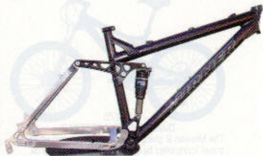
$1879 (Frame and shock) TURNER 5.5 SPOT

These guys lean towards the more aggressive side of trail riding, so expect strong and stiff, but light, nimble, and capable enough to handle twisty singletrack, rocky descents, and the longest, most technical climbs. The wider diameter tubing and in-house CNC machined rear end make the XCL handle the most aggressive cross-country style riding with a smile. You get five inches of rear wheel travel.