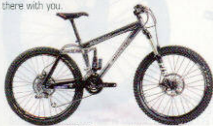
$2295 (Frame and shock) ELLSWORTH MOMENT

Haro dishes out 6.3 inches of rear wheel travel and gives you an aluminum frame that looks like it could be dropped off a cliff. In fact, that's what Haro is expecting the Xeon rider to do. There are three models ($2285 to $4350) and none of them come with any compromises. If you bend towards the technical trails, the Xeon is headed there with you.