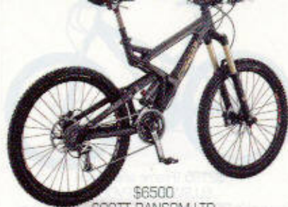
$6500 SCOTT RANSOM LTD

SPECIALIZED STUMPJUMPER PRO CARBON Specialized delivers the Stumpy Pro Carbon with their own AFR shock with Brain Fade (a feature that doesn't allow the rider pedaling or weight to activate the suspension), a Fox TALAS RLC fork with alloy steerer and Magura Marta hydraulic disc brakes. You get 4.7 inches of travel in the rear and 5.5 inches up front. Specialized offers ten versions of their Stumpjumper. The top three use this carbon frame while the others rely on aluminum. The SJ Comp starts at $2200 and won our recent trailbike shootout (December 2006).