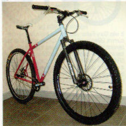
$985 (Frame only) SPOT 29 FRAME

Should we put this in the trailbike or black-diamond section? We could have put it in both. Dial your fork down, and climb up your most technical singletrack. When you begin your descent, the EVO isn't going to hold you back. It begs to be bombed down the gnarliest of trails. A little on the heavy side for a trailbike, but if you are fit, it is worth it. Tested in our November 2006 issue.