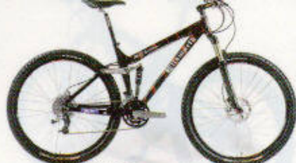
$2195 (Frame and shock) ELLSWORTH EVOLVE

Ellsworth's 29'er frame with four inches of travel gets a steepened head tube to give it a short wheelbase (43.9 inches for the 18-inch frame) for a 29'er. It has a very low standover height on all the models, which allows the rider to make a selection based on cockpit (top tube) length. This lower standover height also may be just what shorter riders need to get into the 29'er movement.