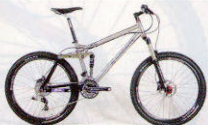
$2195 (Frame and shock) ELLSWORTH ORACLE

Many of us want an aggressive trailbike, but see little or no merit in the latest crop of boat-heavy, big-hit bikes as a means to enjoy the precious few minutes of technical descending that most single-tracks offer. The Blur is the perfect compromise, because its technical handling is phenomenally good, but it still has a strong dose of that magic cross-country feel under acceleration and while climbing. The Blur LT is built tough enough to be an everyday ride, and its design is simple and pleasing to the eye.