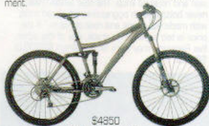
$4950 NORCO FLUID SE

Ellsworth's 29'er frame with four inches of travel gets a steepened head tube to give it a short wheelbase (43.9 inches for the 18-inch frame) for a 29'er. It has a very low standover height on all the models, which allows the rider to make a selection based on cockpit (top tube) length. This lower standover height also may be just what shorter riders need to get into the 29'er movement.