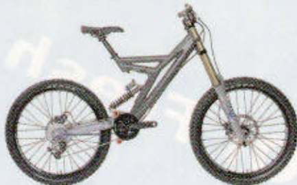
$2499 (Frame and shock) CHUMBA RACING F5

Where else can you get eight inches of rear wheel travel and a standover height that would make a gnome comfortable? Fitting on the Rogue is only the first surprise. This thing pedals like it wants to be in a cross-country race. You'll feel the weight while climbing, but this is still one of the best-pedaling black-diamond bikes we have ridden.