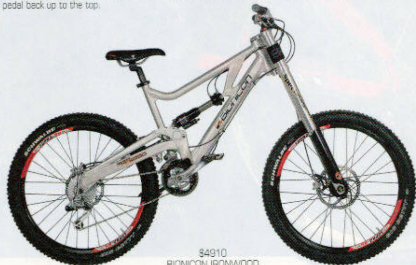
$4910 BIONICON IRONWOOD

This was a tough call. The MLB could easily go in our trailbike section, because any rider in reasonable shape could climb any mountain on this bike. Still, it is so tough, and with 6.5 inches of travel, you could spend a summer at Whistler on this bike. So go ahead, take the black-diamond route down and then pedal back up to the top.