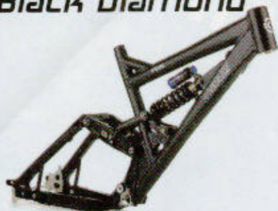
$2995 (Frame and shock) KNOLLY V-TACH

Knolly says their V-Tach is "nimble enough to get you into trouble; solid enough to get you out." This escape vehicle has 7.7 inches of rear wheel travel and linkages that look like you could flat-tend them for years without complaint. The full-length seat tube is a very nice touch for a bike with this much travel.