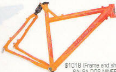
$1018 (Frame and shock) SALSA DOS NINER

The Remedy's R1 active suspension doles out six inches of rear wheel travel through a Rockerlink that is tuned for heavy duty trail riding. There are four models from $1980 up to the Remedy 66. Too much bike for tame trails. The Remedy wants it steep, rough and scary.