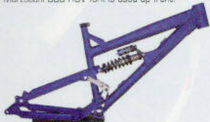
$2149 (Frame and shock) TURNER HIGHLINE

The Scott High Octane uses alloy 7005 hydroform tubing, downhill geometry, a carbon seat mast with seat angle adjustment, a head tube that is compatible with 1-1/8 or 1.5-inch headsets, an ISCG mount and interchangeable dropouts. Rear wheel travel is from seven to 9.4 inches, and a Marzocchi BBB RCV fork is used up front.