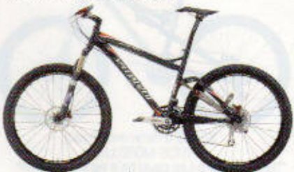
$4200 SPECIALIZED EPIC MARATHON

This is the latest edition to Maverick's growing line of mountain bikes. Claimed to have a little over five inches of rear wheel travel, the Durance has a steeper seat tube angle and lower top tube, plus Maverick makes them in a double-X size for tall riders. The idea of the Durance was to deliver a bike with long legs, but light enough to be ridden as an all-day, all-condition bike.