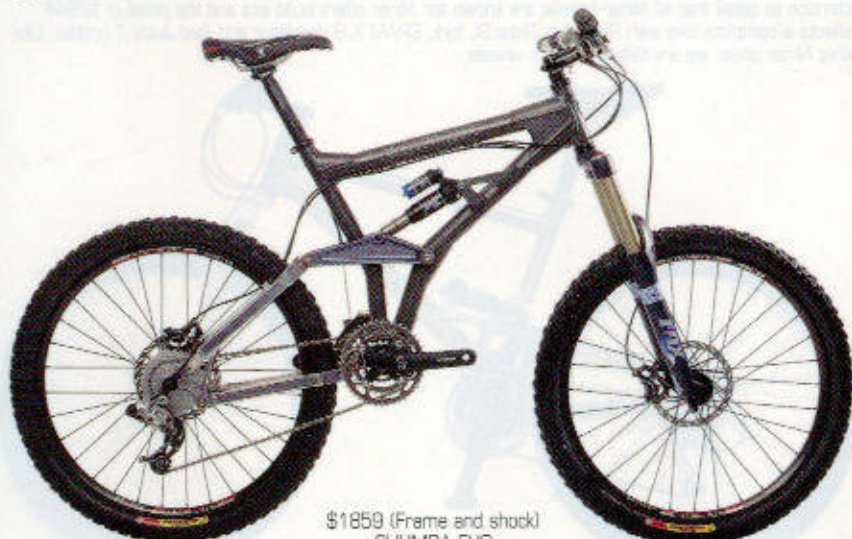
$1859 (Frame and shock) CHUMBA EVO

A super versatile trail bike that we tested way back in the December 2003 issue. The 2007 5.5 Spot received subtle but significant changes including a redesigned and torsionally stiffer rocker for increased travel without an increase in frame weight. The frame offers excellent mud clearance. We've seen this frame used for everything from cross-country racing to 4-Cross.