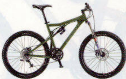
$1699 (Frame and shock) SANTA CRUZ BLUR LT