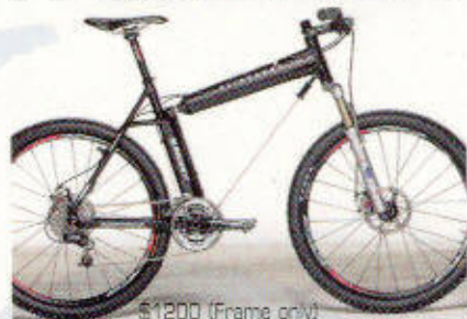
$1200 (Frame only) SLINGSHOT RIPPER

You are looking at the world famous Slingshot, using SPT (Sling Power Technology). The downtube is actually a spring-loaded cable that when combined with the composite flexboard and boomtube (top tube) gives you a ride like no other mountain bike. We have not had one to test since 1999, so we can't say for sure how this model stacks up to the other modern trailbikes. If you get a chance to demo one, you've got to try it.