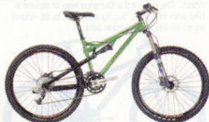
$2495 (Frame and shock) TITUS MOTO LITE

The most highly anticipated trailbike of 2007, this six-inch travel trailbike has a tough act to follow (the Titus Moto Lite is an MBA favorite). This new-from-the-tire-up Titus offers a lot more than an additional inch of travel over the Moto Lites. It is built for major abuse with aluminum rockers that should produce zero flex and easy-to-tune suspension. Expect a test in our pages in the near future.