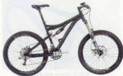
$1995 (Frame and shock) TITUS EL GUAPO

The Ti Deluxe is a durable, "perfectly-aligned" hardtail (that's IF's dig on builders who might get a little sloppy) that has a vast quantity of build options including rider-specific tube sets and geometry and the ability to build it around the fork of your choice. Yes, it can be a killer cross-country racer as well as a trailbike for someone who doesn't do "production." This company is committed to quality and attention to detail that a bicycle frame factory can only dream about. If you want a rare, expensive, custom mountain bike, Independent Fabrication is what you are about.