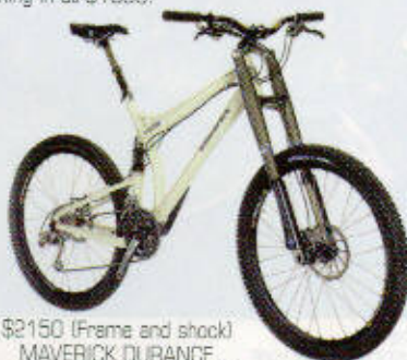
$2150 (Frame and shock) MAVERICK DURANCE

Better known in Canada than the States, Norco's top-of-the-line trailbike offers 5.6 inches of rear wheel travel and externally adjustable fork travel from 3.9 inches to 5.5 inches. The SE has a Shimano XTR drivetrain. The company offers the Fluid in four other models, with the Fluid Four coming in at $1365.