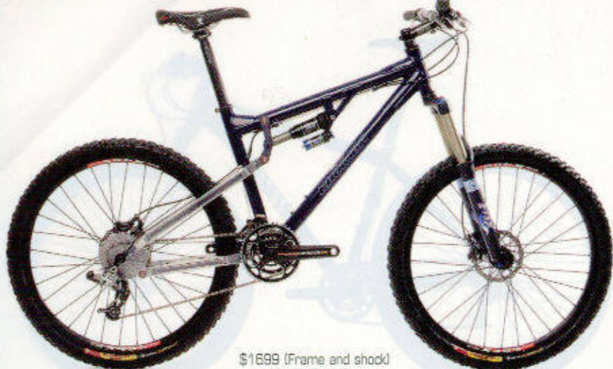
$1699 (Frame and shock) TURNER 5.5 SPOT

These guys lean towards the more aggressive side of trail riding, so expect strong and stiff, but light, nimble, and capable enough to handle twisty singletrack, rocky descents, and the longest, most technical climbs. The wider diameter tubing and in-house CNC machined rear end make the XCL handle the most aggressive cross-country style riding with a smile. You get five inches of rear wheel travel.