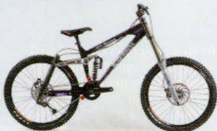
$2398 (Frame and shock) ELLSWORTH ROGUE

The 2007 Highline is rolling proof that Dave Turner listens to riders. By equipping the 2007 Turner Highline with a shorter 2.5-inch travel shock, Turner has reduced its wheel travel to 7.1 inches. This modification provides greater versatility, especially when the bike is equipped with a single-crown, long-travel fork (1.5-inch head tube).