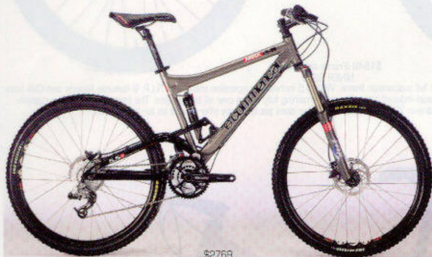
$2769 COMMENCAL META 5.5 2

With a push of a control button on the right handlebar, a Bionicon rider can slacken the head angle and increase the fork travel for descending. Or he can reduce the travel, with a considerably steeper head angle as the grade reverses into an uphill situation. Think of it as custom tuning your bike's geometry on the fly. We tested the Edison version in our October 2005 issue. The Golden Willow adds travel and Bionicon's Double Agent fork to the mix.