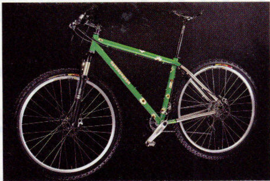
$3250 (Frame only) INDEPENDENT FABRICATION TI DELUXE

Tested in our September 2006 issue, the wrecking crew felt, "The LTD's agile handling instills confidence to attack gnarly trails, thanks to its 45-inch wheelbase and 68-degree head angle. The low-speed compression damping of the Fox 36 TALAS fork is difficult to keep in the desired position because it's under the high-speed compression and rebound knob. The rear wheel travel never bottomed on aggressive, advanced trails with moderate drops and rock gardens." If the price is too big a nut to crack, one of the other five Ransoms may work for you (from $2800 to $6500).