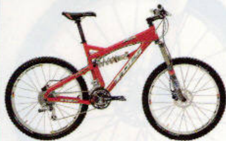
$1769 (Frame and shock) FOES 2:1 FXR

This softtail uses a Salsa Reishi shock and the flex of the scandium chainstays to give the Dos Niner rider around an inch of, if not travel, cush. Did we mention it also uses 29-inch wheels? Best for the dual-suspension holdout who is tired of taking a beating at the hands of a hardtail.