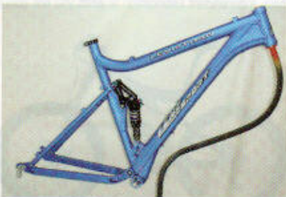
$1875 (Frame and shock) LENZ SPORT LEVIATHAN

This popular trailbike doesn't get any changes over the 2006 version (tested in our August 2006 issue). Like we said then, "The Epiphany is a dream come true for that rider who is coming back to the sport (or for the trail rider ready to step up from the mid-priced zone). It can blur the line between a cross-country race bike (some racers looking to improve on their descending times have opted for the Epiphany over the Truth) and an all-day-everyday trailbike. This is a bike that smoothes the trail, rewards its rider for the effort he puts in and is ready to welcome any serious rider back into the fold."