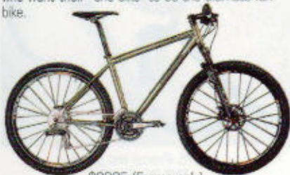
$2895 (Frame only) LINSKEY PERFORMANCE HB310MTN

The Moment earns a place alongside the Santa Cruz Heckler—one of our all-time-favorite, do-anything trailbikes. Few mountain bikes are as easy to ride, as forgiving in technical situations, or as fun to play on as the Moment. The Moment has more of everything an experienced trail rider wants. Ellsworth's new ride should be a hit for those of us who want their "one bike" to be the ultimate fun bike.