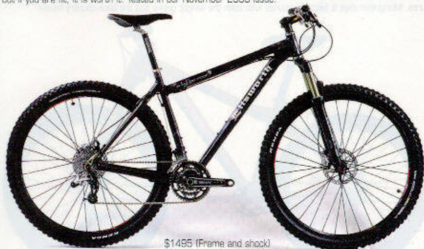
$1495 (Frame and shock) ELLSWORTH ENLIGHTENMENT 29

Lovingly crafted in Golden, Colorado, the Spot guys feel their 29 Frame is ideal for the taller trail rider who has always been cramped on a 26-inch wheel mountain bike. Spot uses slightly ovalized downtubes and larger diameter seat tubes to stiffen up the bottom bracket area and give you the "Spot" feel.