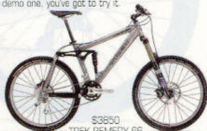
$3650 TREK REMEDY 66

You are looking at the world famous Slingshot, using SPT (Sling Power Technology). The downtube is actually a spring-loaded cable that when combined with the composite flexboard and boomtube (top tube) gives you a ride like no other mountain bike. We have not had one to test since 1999, so we can't say for sure how this model stacks up to the other modern trailbikes. If you get a chance to demo one, you've got to try it.