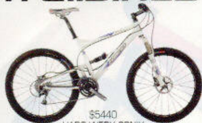
$5440 HARO WERX SDNIX

This is a bike that falls on the racy side of trail riding, so lots of riders have pressed them into service for 24-hour racing. There are four models ($1960 to $5440) and all of them use Haro's Virtual Link Suspension to deliver 4.7 inches of non-bobbing rear suspension. The Sdnix version comes with the finest components from Shimano, Fox and WTB.