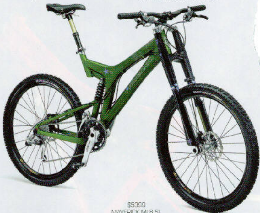
$5399 MAVERICK MLB SL

The Jackal's hunchback tube will put off riders who are looking to push the limits of tricks that require one or more limbs crossing over the top tube. The Jackal is a tough little dog that is built to take a beating. If you are all about going big without going crazy, the Jackal will fit the bill.