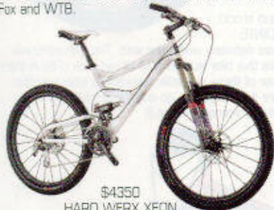
$4350 HARO WERX XEON

This is a bike that falls on the racy side of trail riding, so lots of riders have pressed them into service for 24-hour racing. There are four models ($1960 to $5440) and all of them use Haro's Virtual Link Suspension to deliver 4.7 inches of non-bobbing rear suspension. The Sdnix version comes with the finest components from Shimano, Fox and WTB.