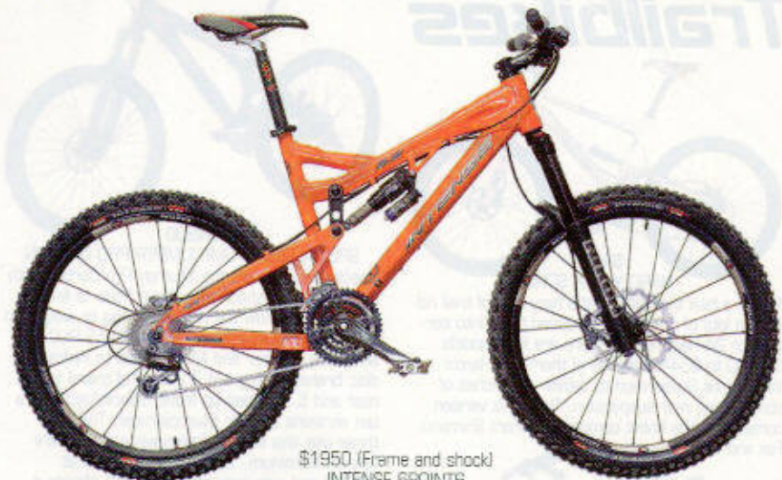
$1950 (Frame and shock) INTENSE 6POINT6

This is a race bike, so why is it in our trailbike section? Don't let the 3.9 inches of travel fool you. This is an ultra-capable trailbike because the travel is pure quality. The Specialized AFR Shock, with its herd-tail-firm-to-trail-tune adjustability, does what many bikes with another inch of travel can't: go fast uphill. There are nine Epics in the Specialized line with standard Epics starting at $2200.