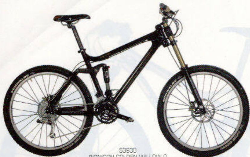
$3930 BIONICON GOLDEN WILLOW 0

With a push of a control button on the right handlebar, a Bionicon rider can slacken the head angle and increase the fork travel for descending. Or he can reduce the travel, with a considerably steeper head angle as the grade reverses into an uphill situation. Think of it as custom tuning your bike's geometry on the fly. We tested the Edison version in our October 2005 issue. The Golden Willow adds travel and Bionicon's Double Agent fork to the mix.