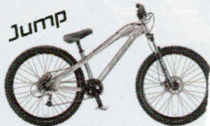
$550 (Frame only) SANTA CRUZ JACKAL

The F5 takes the place of Chumba's F4 and incorporates new technology that makes the bike stiffer, lighter and stronger. Chumba has lowered the center of gravity, so the bike handles in an extremely nimble and light manner.