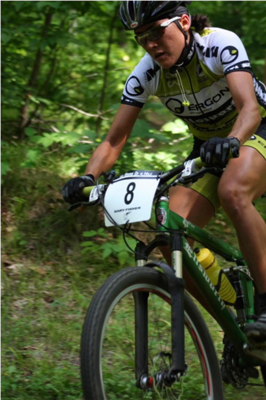
Pua getting it done!