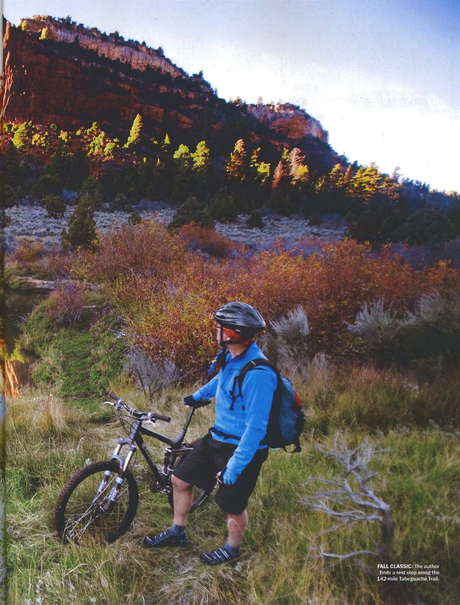
FALL CLASSIC: The author finds a rest stop along the 142-mile Tabeguache Trail.