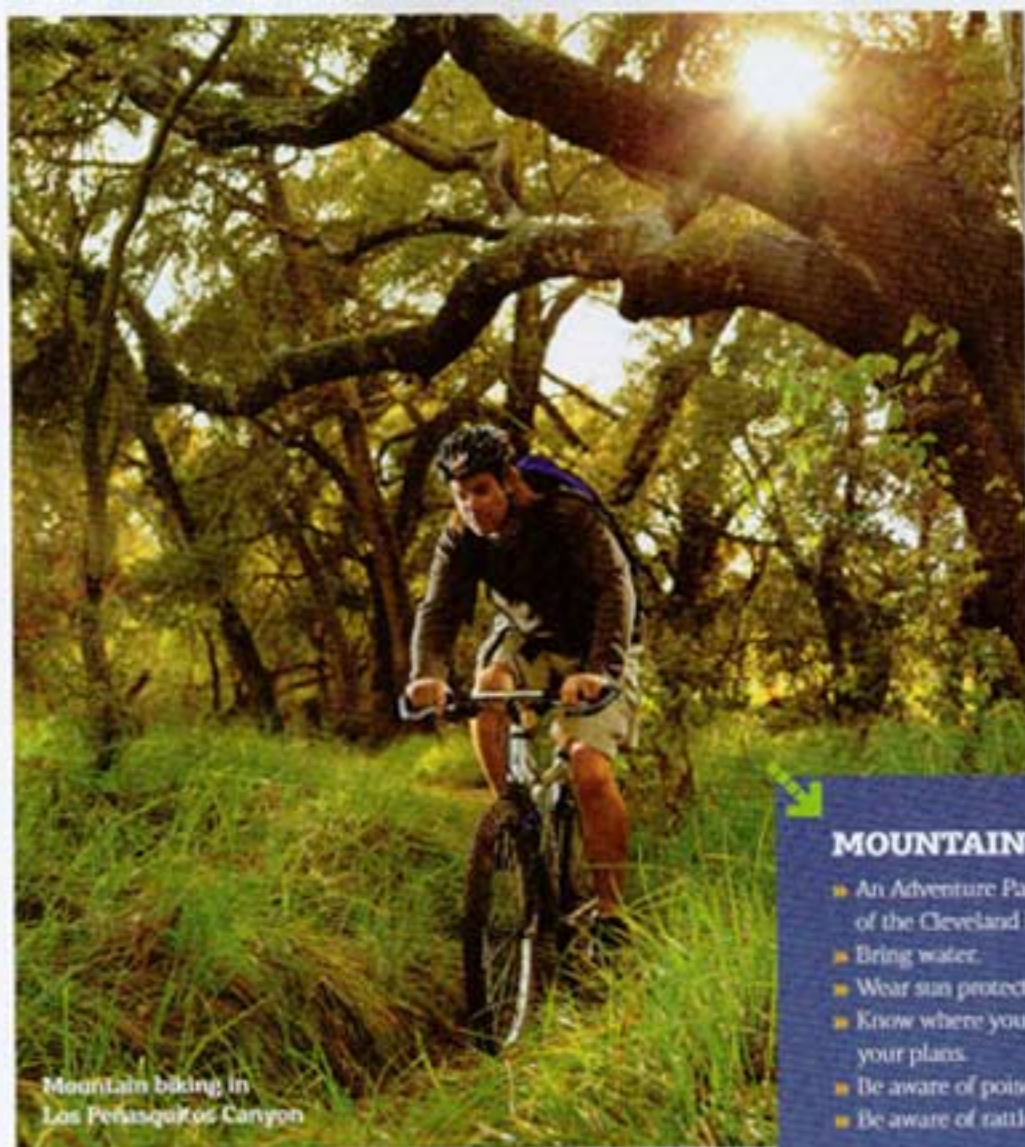
Mountain biking in Los Peñasquitos Canyon

River. Proceed up a steep gravel road with a breathtaking vista of the valley below. Follow the road into the valley, turn onto the Sycutt wash trail, and ride north. Back down into the valley, ride to the saddle between the Fortunias. Hold on as you bike back down the "Alley." Riding through grasslands, you'll encounter the Father Junípero Serra Trail. Ride to Mission Gorge Road, turn right for two-tenths of a mile, and you'll complete the loop of about 6 miles.